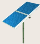
SunSonix™ Land Based Solar