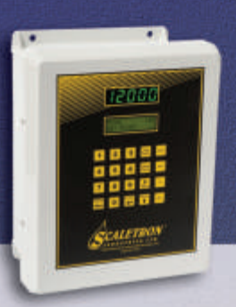
1099 Chemical Process Controller (Optional)