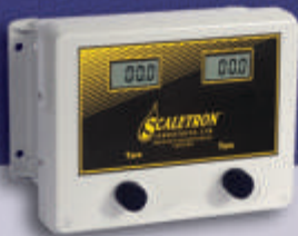
Dual 3-1/2 Digit Indicator (Standard)