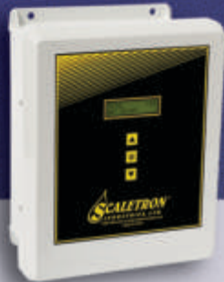
1020™ 5 Digit Controller (Optional)