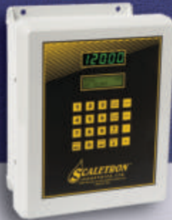
1099™ Chemical Process Controller (Optional)